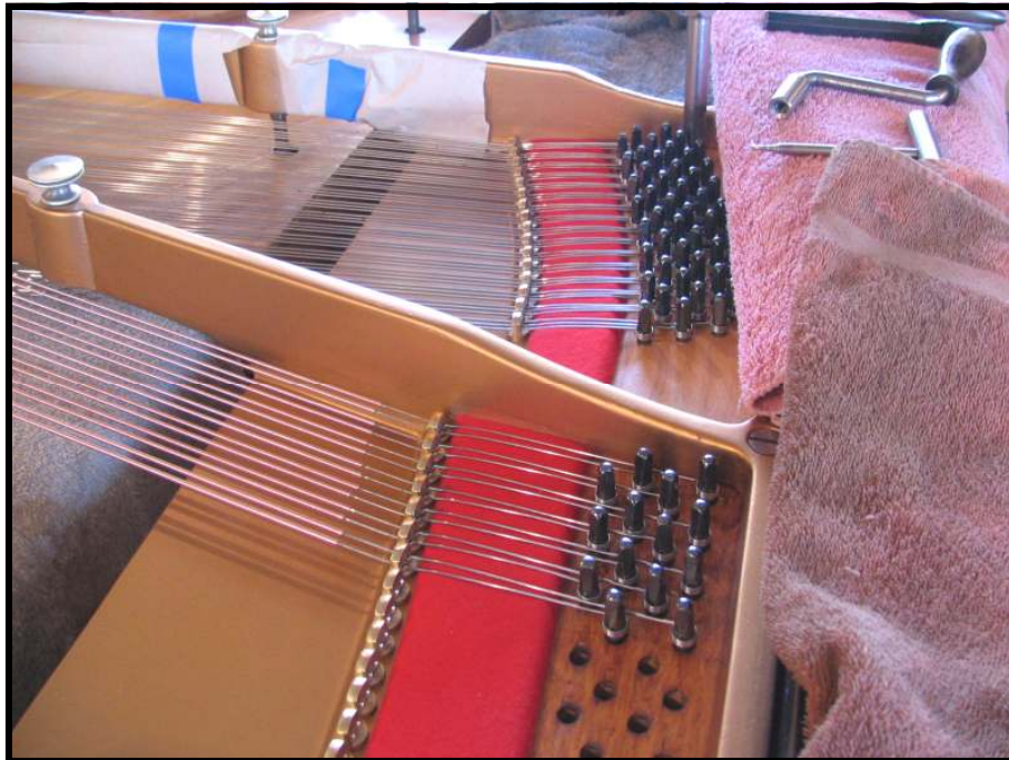
Installation of a new set of bass stings in progress.

One characteristic which all great-sounding pianos have in common is that they possess a rich, vibrant bass. A strong, resonant bass brings the music played on a piano to life. Unfortunately, as an instrument ages the bass strings which give the piano its musical heartbeat tend to deteriorate. Gradually, over the decades, the tone of the typical acoustic piano loses some of its original luster, and the instrument may come to have a bass sound which is "tubby" and not strong and vibrant. At this point, replacement of the factory-installed bass strings is in order. The bass section of your piano has gotten to the point where it would benefit tonally from the installation of a new set of bass strings.